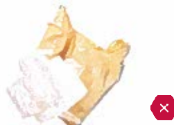
NO Loose Plastic Bags, Bagged Recyclables or Film Empty recyclables directly into your bin