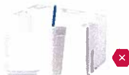
NO Foam Cups, Containers or Straws