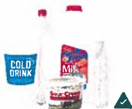
Plastic Bottles, Cups & Containers