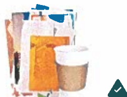
Paper & Paper Cups