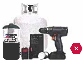
NO Batteries, Power Tools, Flammables or Hazardous Waste